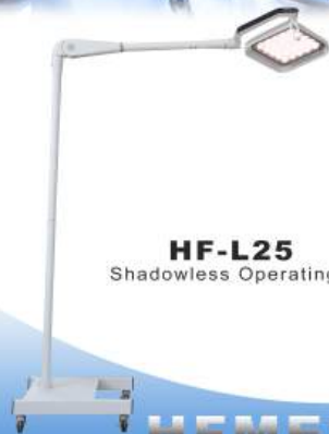
HF-L25 Shadowless Operating lamp