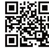
Official QR code